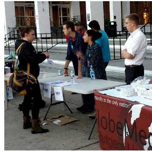
Students collaborate in support of climate change policy

On October 14 th , The First Annual Rutgers Climate Fest was hosted on the steps of Brower Commons to take a stance on climate change. A multitude of organizations were in attendance including the Rutgers Fossil Fuel Divestment Campaign, GlobeMed, the Veg Society, Take back the Tap, United Students Against Sweatshops, and even the Bernie Sanders Campaign. At Climate Fest, student organizations stood in solidarity for environmental activism and climate change policy. The purpose was to raise awareness for the organizations in support of climate action and discuss the types of campaigns available to students at Rutgers. Along with messages for environmental change, Vegan pizza was available to members of the Veg Society as well as to other attendees.