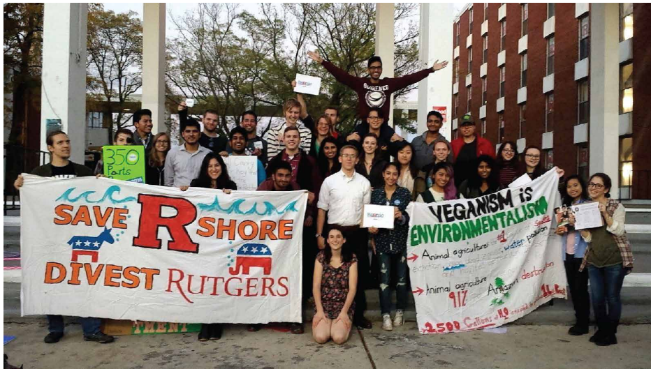
Group picture of student organization's that participated